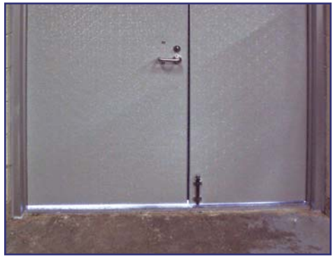
Before - without Adjustable Bottom Brush