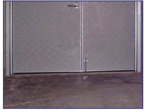
After - with Adjustable Bottom Brush