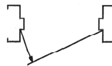
Right Hand Reverse