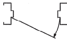
Left Hand Reverse