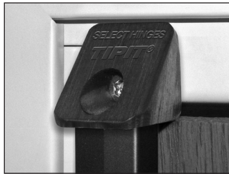
Black polymer TIPIT® C on Dark Bronze concealed hinge.

SELECT's patented, ligature-resistant TIPIT® keeps patients safer. Whether as a retrofit application for existing hinges or in new construction, the TIPIT will deter patients or inmates from harming themselves by hanging objects from the hinge.