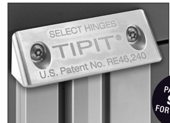
Metal TIPIT® L on Clear anodized SL57 full surface hinge.