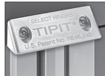
Metal TIPIT® L on Clear anodized SL57 full surface hinge.