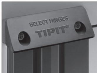
Black polymer TIPIT® L on Dark Bronze SL57 full surface hinge.

NOTE: Not for use with concealed safety hinges (SL71).