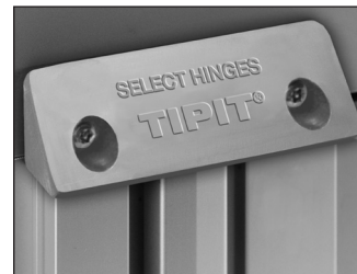
Gray polymer TIPIT® L on Clear anodized SL57 full surface hinge.