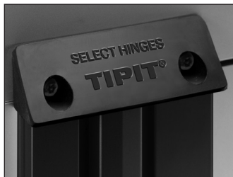
Black polymer TIPIT® L on Dark Bronze SL57 full surface hinge.

NOTE: Not for use with concealed safety hinges (SL71).