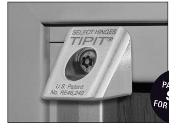
Metal TIPIT® C on Clear anodized concealed hinge.