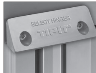
Gray polymer TIPIT® L on Clear anodized SL57 full surface hinge.